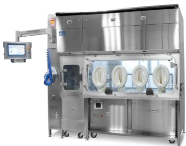
Aseptic Containment Isolators (ACTI) 2016-2017