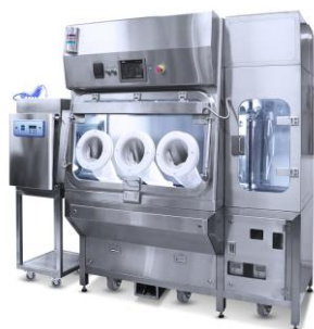
Cell Processing Isolators (CPI) 2019