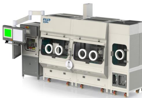
Cell Processing Isolators (CPI) 2020

Over the past few years, Esco has had the opportunity to handle numerous isolator projects for cell processing application. It was only recently that the company decided to create a new line of isolators specifically for bioprocessing under the category of Cell Processing Isolators .