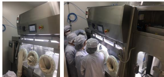
Figure 3. CPI installed in the facility

It is capable of carrying out pressure decay tests, biodecontamination, as well as auto-compensation, enabling the unit to adjust and maintain the required negative pressure environment. Through this mechanism, It ensures process containment and operator protection in cases of breach in the system.