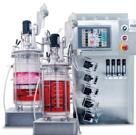
The VacciXcell Hybrid Bioreactor

The Gentle Giant of Adherent Bioprocessing