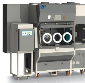
Figure 4. Cell Processing Isolator's 3D Image