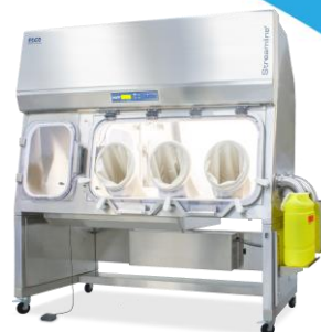
Stand Alone Isolator with Third-party Equipment SCI | HPI