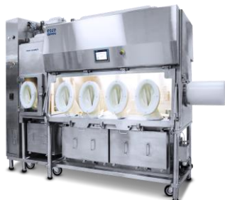
Isolator Ready with Cell Therapy Equipment GPPI | CPI | APPI