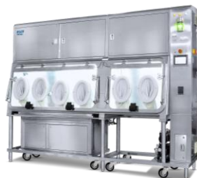
Temperature and CO 2 Control TFAI | ACTI