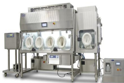
Advanced Processing Platform Isolators (APPI) 2018